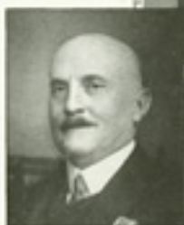
Joseph Caillaux, Noted French Orator, writes:

"I have found your Lucky Strike Cigarettes very agreeable. They do not hurt my throat in the least and are very soothing to my voice."