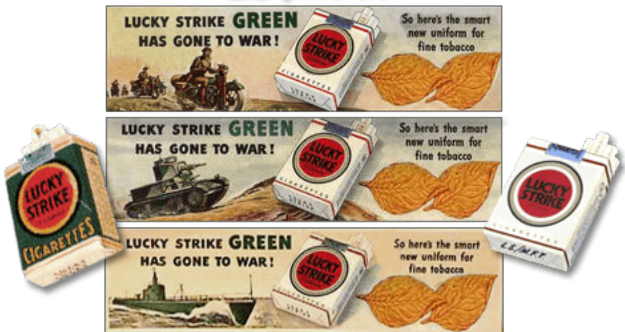
Print Adverts by Lucky Strike (1910s to 1950s)