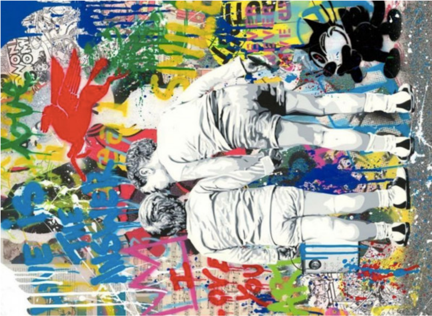
Brother's Advice – Love Is The Answer 2021