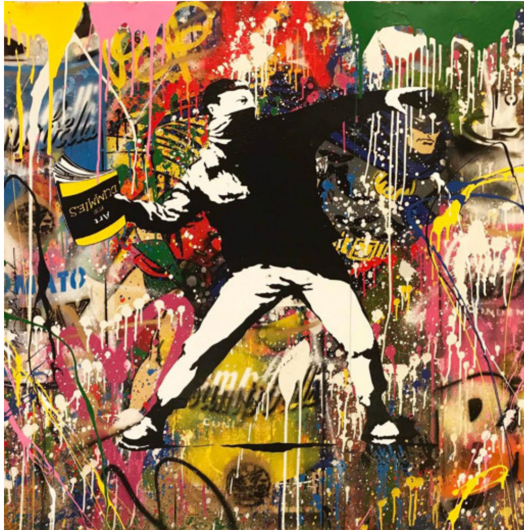
Banksy Thrower 2017