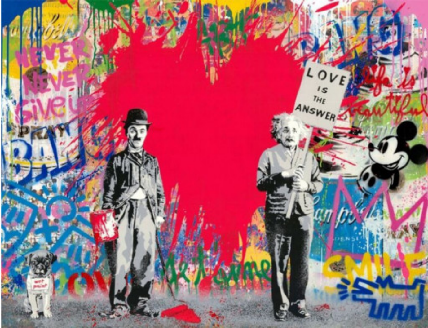
Juxtapose Red 2021