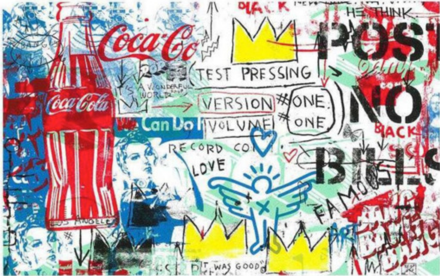
No Posts, No Bills 2021