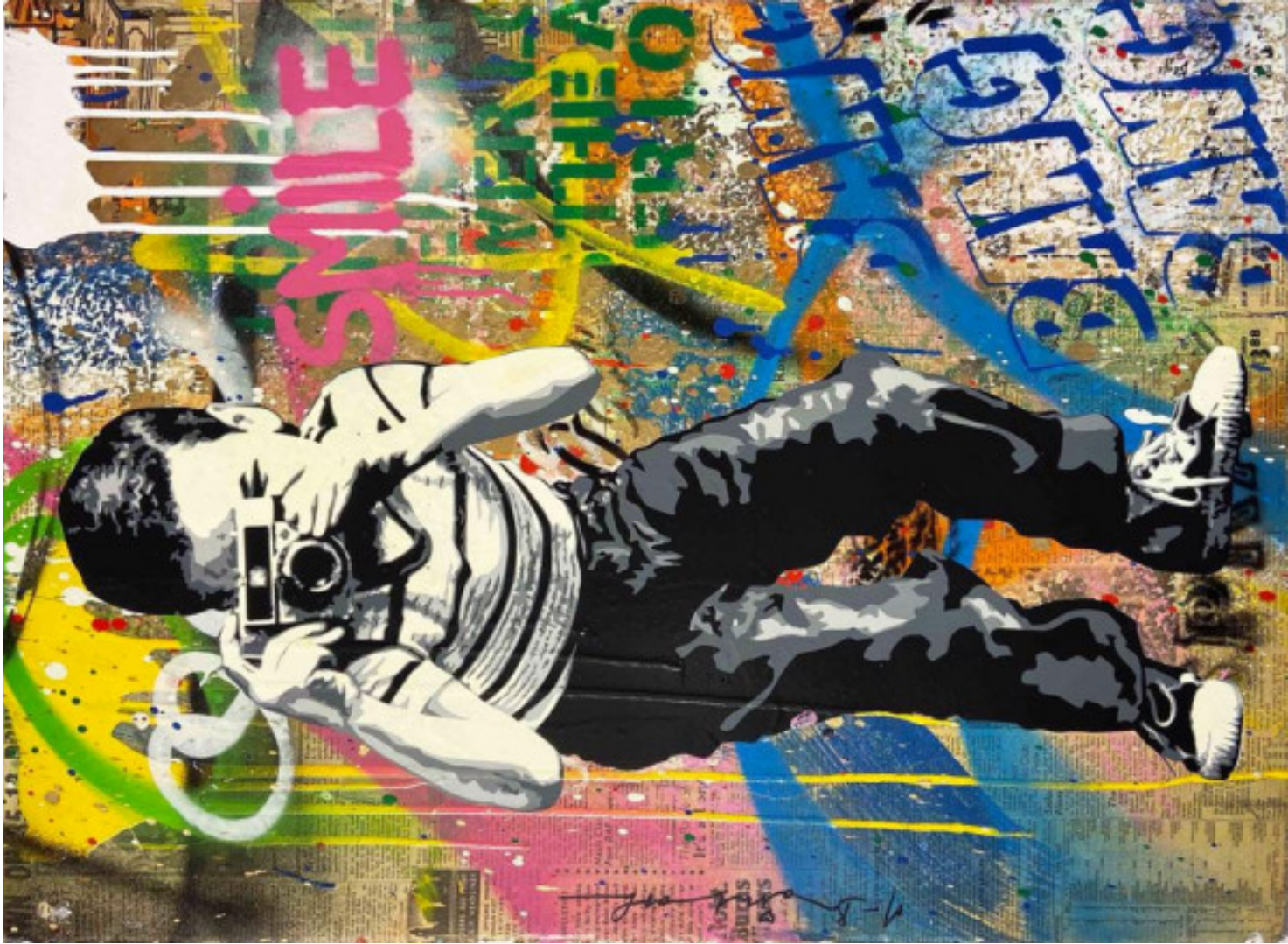
Smile – Life Is Beautiful 2021