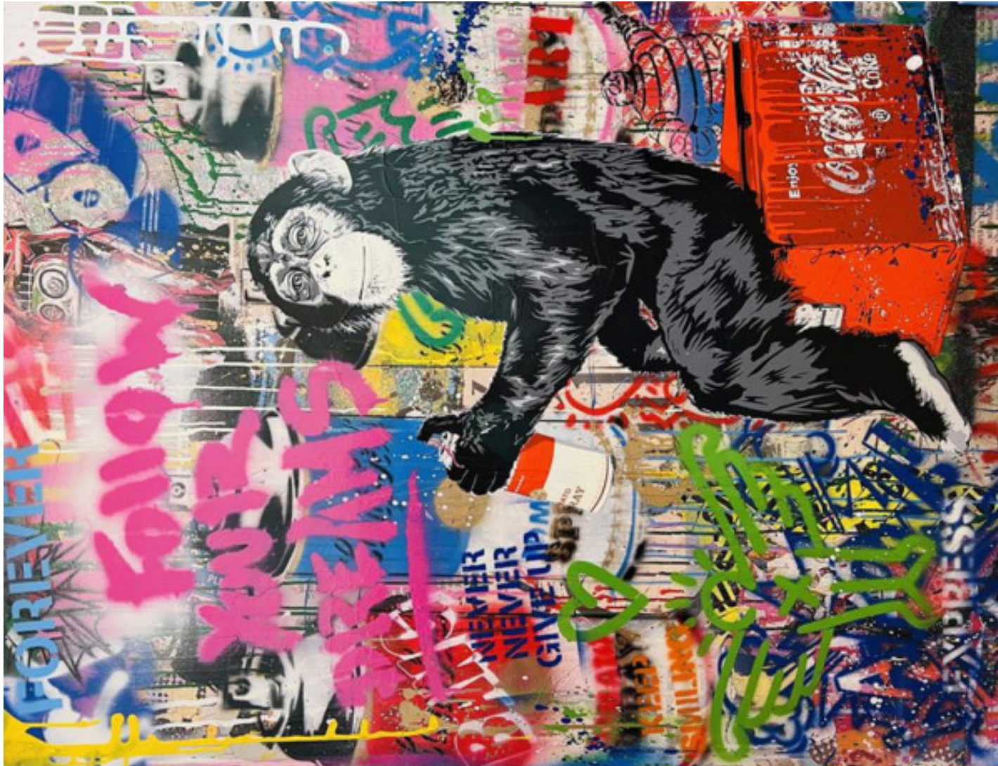
Everyday Life – Follow Your Dreams 2020