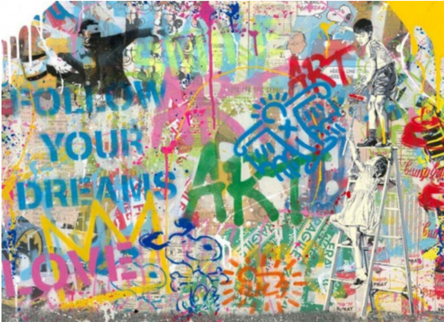
Helping Hand – Snopy and Banksy Thrower 2020