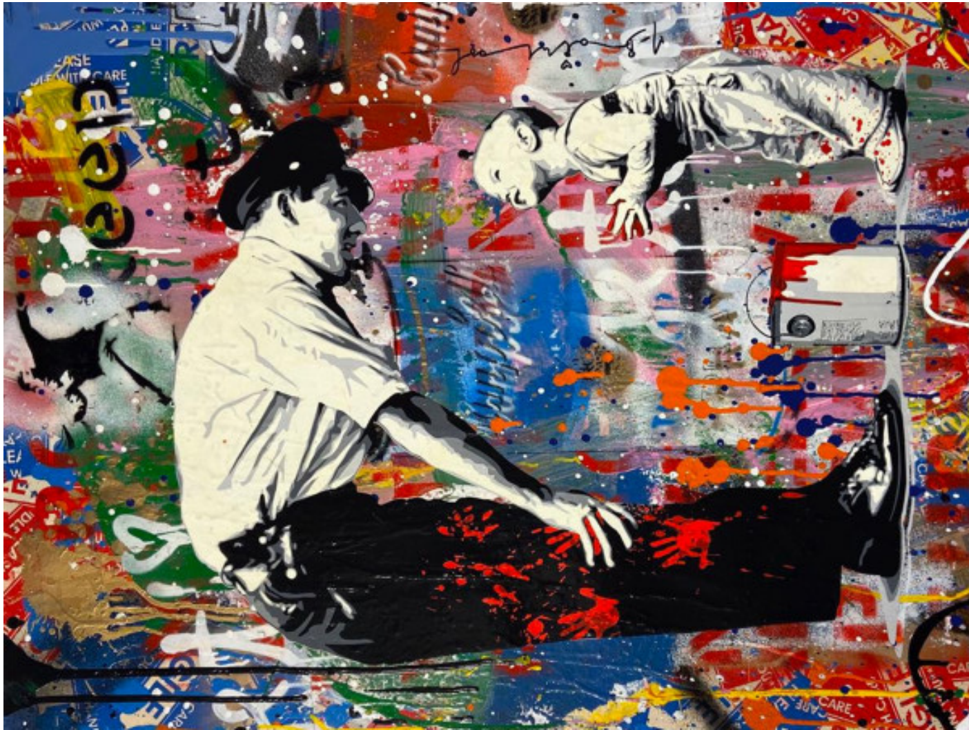
Not Guilty 2019