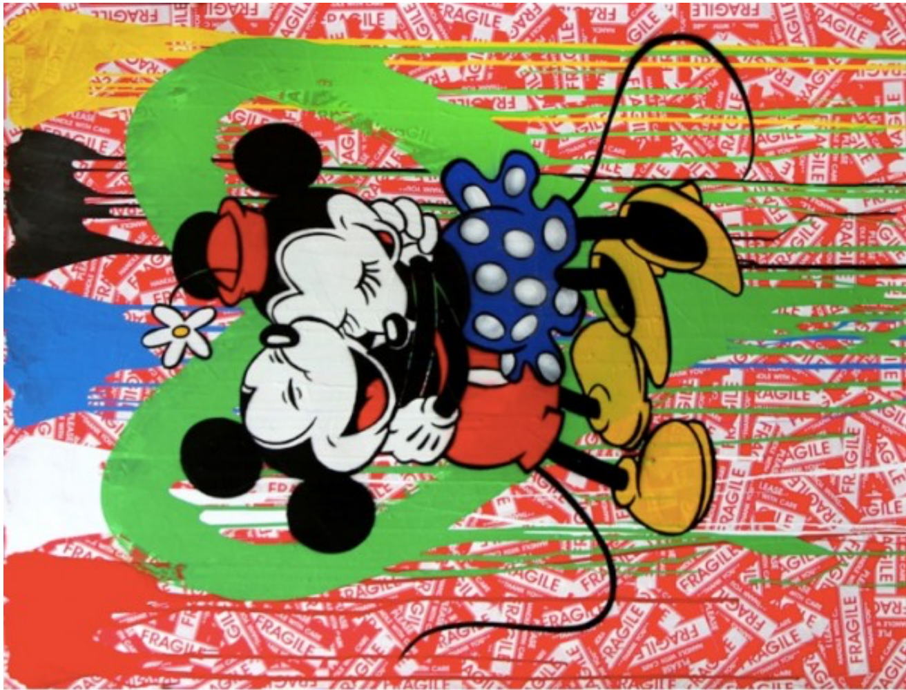
Mickey and Minnie 2014