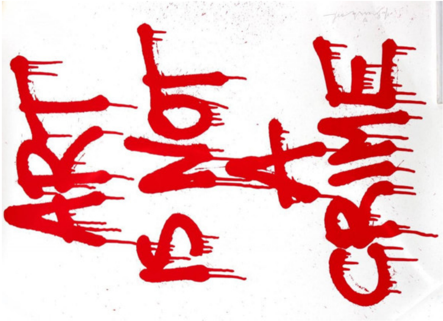
Art Is Not A Crime 2009