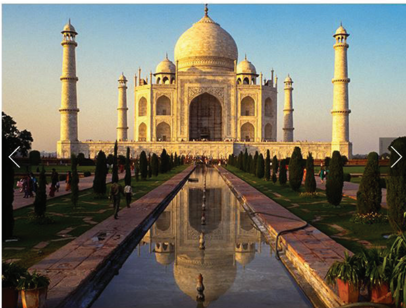
Reflecting Pool

Mogul emperor Shah Jahan built the Taj Mahal in Agra, India, as a tribute to his favorite wife, who died in childbirth in 1631. The white marble monument, with its sprawling gardens, took more than 15 years to build.