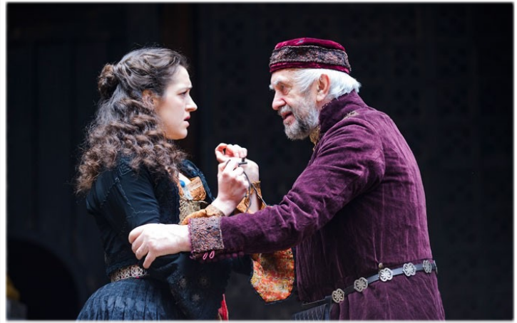
Shylock the Jew threatens his daughter, Jessica.

UNLUCKY PRINCE SAILS HOME WITHOUT PORTIA page 3